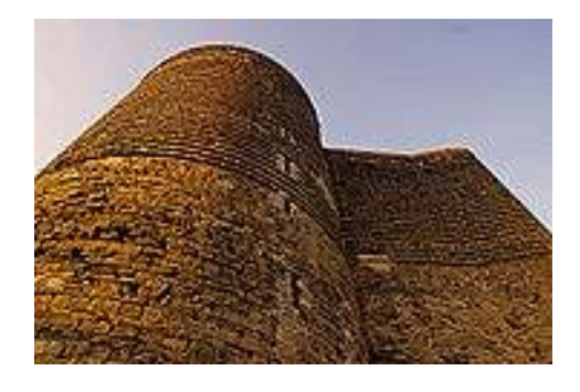
The Maiden Tower, XI-XII centuries, in old Baku.

With the growth of significance of Baku as a commercial city, the caravan-sarays built around the Maiden Tower, were a kind of medieval hotels, which as a rule, belonged to some merchant guilds of different cities, each bearing the name of its owner. There were merchants living and trading in Baku, they came not only from nearby towns, but also from the farthest towns of the Caucasus, Iran, Central Asia, Russia and other countries. For example, the merchants from Panjab, Hujarat and Rajputana lived in the caravan-saray "Multani". "Butchery" was a place for the concentration of merchants from the Central Asia which was situated near it. As a whole, development of such places is an evidence of a considerable growth of cultural, commercial and political contacts of the state of Shirvan, which also included Baku, with the neighboring and distant countries in XV-XVI centuries. It is enough, as we think, to give just one fact, as a proof of it that in 1572 Baku was visited by the agents of the English trade company, who displayed interest in the Baku oil. F. Decket, a members of that mission informed that "... there is a strange phenomenon near a city called Baku.