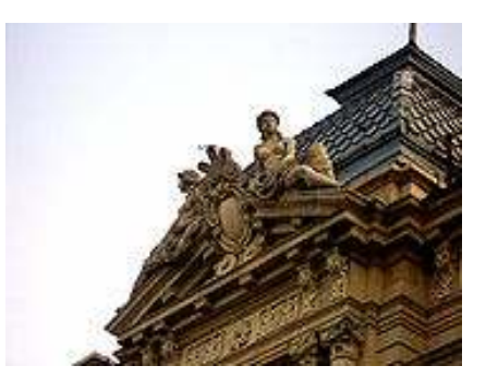
State Museum of Art in Baku.