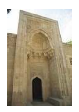
Mausoleum of <u>Shirvanshahs</u> in <u>old Baku</u>.

The highest rise of Baku in the epoch of feudalism was at the time when, as a result of a destructive earthquake in Shirvan the capital of the state was moved from Shemakhi to Baku. Exactly in the following hundred years the planning of the castle starts to take shape. And the Shirvanshahs Palace, unique in beauty and grace, was founded on the highest place in the castle. The Palace includes nine buildings serving various purposes. Virtuosity of its creators, who "knitted" the finest laces of stone ornaments on portals of "Divan-khane" and the family burial-vault of Shirvanshahs, created an organically integral unit for their design and then combined these structures into one indivisible whole, demonstrating the skills and artistic taste of the medieval craftsmen of Azerbaijan.